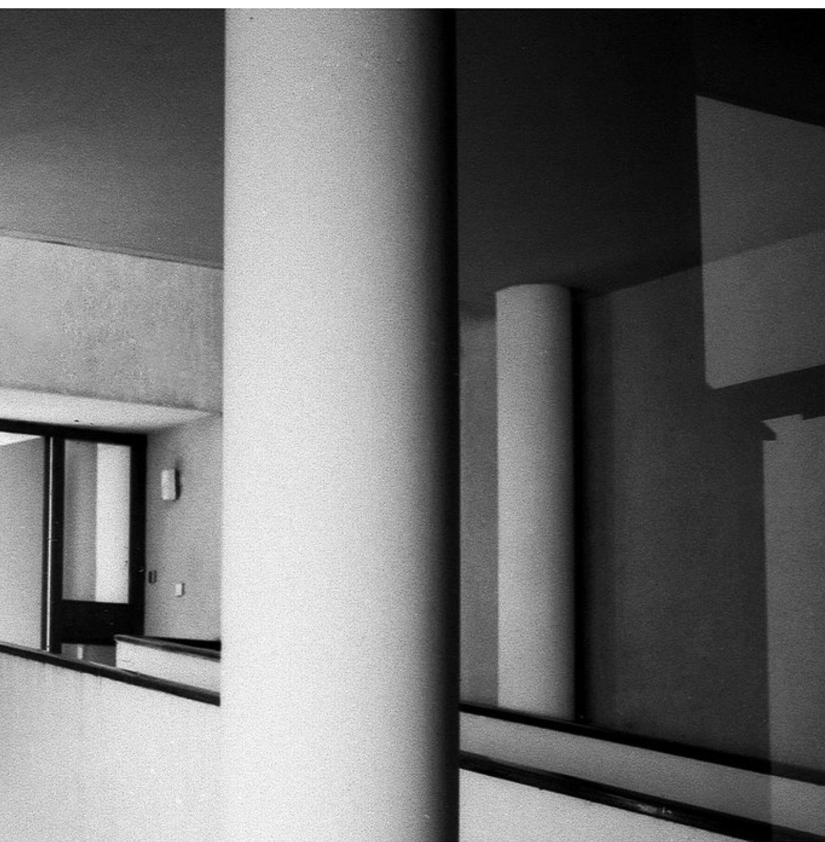
Photographic series about the Curutchet house, the only work by Le Corbusier in Latin America